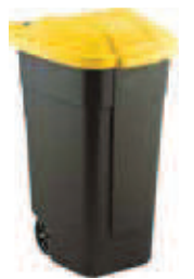
184748 | ~100 L | 58 x 52 x H88 cm 3