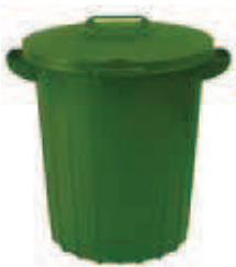
201713 | ~90 L | Ø 49 x H60 cm 4