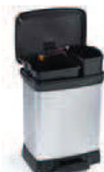
203291 | 10 + 18 L | 39 x 29 x 51 cm 1