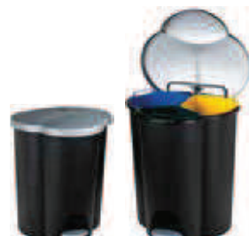
205056 | 2x17L + 1x6L | 48 x 39 x 59 cm 1