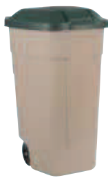
176805 | ~100 L | 58 x 52 x H88 cm 3