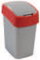
190171 | ~25 L | 26 x 34 x 47 cm 4