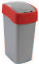
195024 | ~50 L | 29 x 38 x 65 cm 4