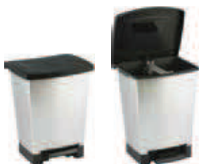
184274 | ~25 L | 34 x 29 x H43 cm 5